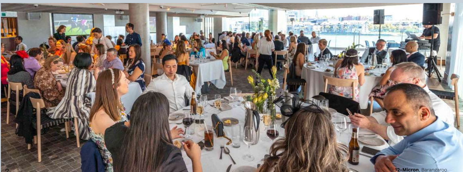
12-Micron, Barangaroo V250716